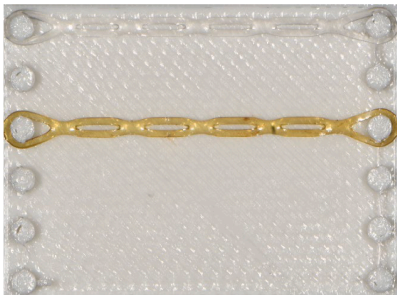
Fig. 2. The most noticeable color change observed in Forestadent short chains after immersion in the coffee solution.

agents (Ahmadizenouz et al., 2016), which may account for the slight increase in the + b* values observed in the current study (Al-Dharrab, 2013). Similar to Red Bull, beer yielded relatively low \Delta E^* values, placing it among the solutions with minimal color change. These results align with existing literature (Chami et al., 2022; Sarembe et al., 2022). Coconut water, like beer, exhibited minimal staining. It can be inferred that the primary cause of discoloration is a reduction in lightness. Specifically, the decrease in the L* value accounted for 97 % of the overall color alteration.